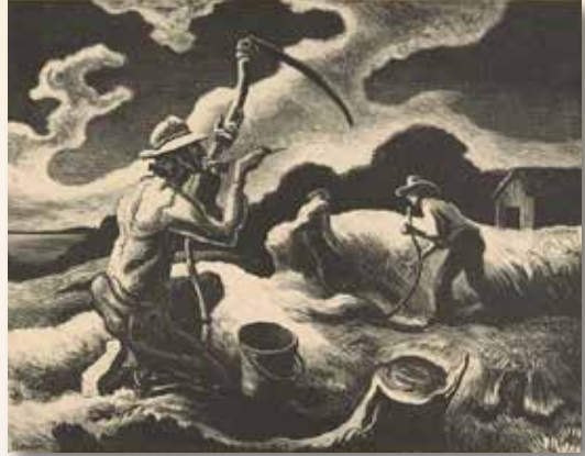
Island Hay , by Thomas Hart Benton

Dunning Gallery | Free Admission Public Reception and Artist Demo during Night on the Town Friday, March 8, 6 - 8 pm