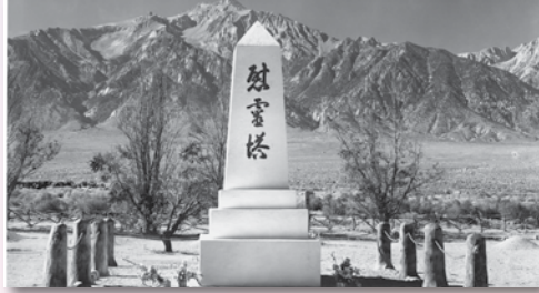
Monument in Cemetery, Mt. Williamson, by Ansel Adams 1943 (detail)

Exhibition organized by Photographic Traveling Exhibitions, Los Angeles, CA.