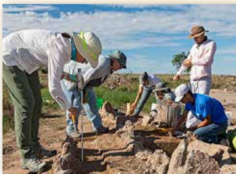
University of Denver, Field School at Amache, 2008

During World War II, Executive Order 9066 was signed by President Roosevelt allowing nearly 120,000 people of Japanese ancestry, including American citizens and lawful permanent residents to be incarcerated in desolate sites in the interior of the United States. One of these relocation centers was Granada Relocation Center—better known as Amache—located in southeastern Colorado. Amache was Colorado's 10th largest city during the War housing over 10,000 American citizens in a one-mile square facility surrounded by barbed wire and guard towers. Residents fostered wellness through gardening as evidenced in the archaeological record discovered by University of Denver's field schools beginning in 2008.