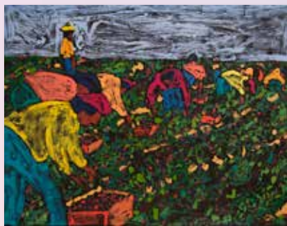
Campesinos de San Luis, by Tony Ortega

Led by artist, Tony Ortega, students will paint an image with opaque etching ink onto a smooth Plexiglas plate. The painted image will be transferred onto black printing paper using a printing press. The result will give the artwork a texture not possible by direct marking/painting onto the paper. The monotype that is pulled off the plate always has an element of surprise, and the final result on paper may look quite different than the image on the plate. One print from each student will be eligible to be displayed in the Museum's print exhibit from March – May. Also, we will have time for a lunch break during the workshop.