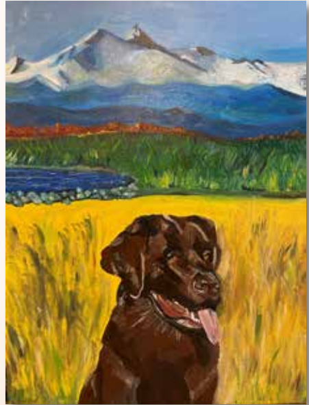
Mousee , by Jenn Hall

The arts are an essential part of a complete education, a growing economy and an engaged community. Art teachers play a crucial role by fostering creativity and self-expression, creating well-rounded and prepared leaders. The arts also encourage strong learning skills such as visual thinking, which makes difficult concepts more readily understandable. Art teachers are also working artists, growing individually and generating important teaching projects for their students. The teaching artist deftly straddles the worlds of creativity and