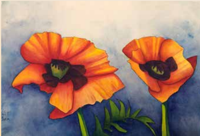
Poppies on 6/12/23 at 8:30 am

innovation, developing their own practice and skills while fostering an appreciation for the arts in future generations. The artists in this exhibition work with students daily to boost critical thinking and observation skills, while simultaneously striving to define the creative language that fosters growth as individual artists. Explore the inspiration and motivation that drives the teaching artist.