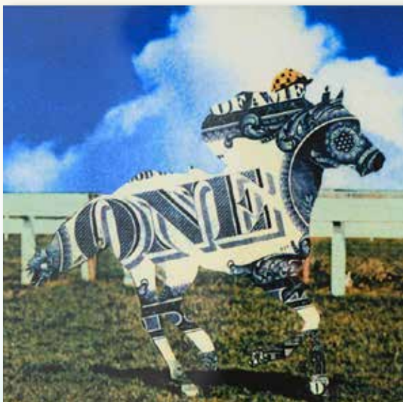
Racehorse, by Lou Beach