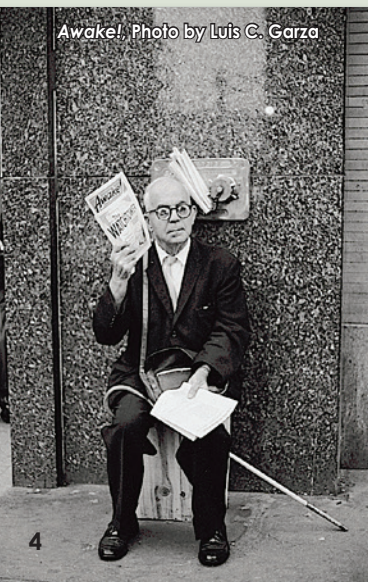
Awake!

As in previous years, art scholarships are awarded to local graduating high school seniors with funds generated from the show.