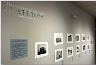
Amache Today: Photography Exhibit