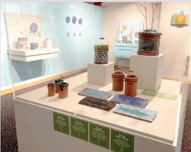
Amy Joy Hosterman: Patterns of Power Exhibit