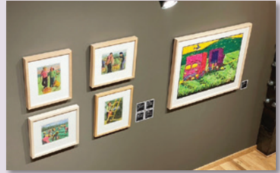
Connection to the Land Exhibit