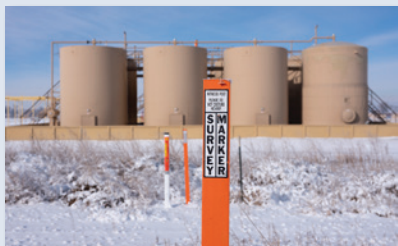
Survey Marker