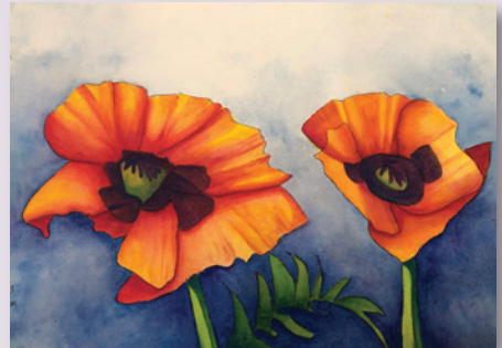
Poppies on 6/12/23 at 8:30 am, by Anne McManus

The artists in this exhibition work daily with students to boost critical thinking and observation skills, while also striving to define the creative language that fosters their growth as individual artists. Explore the inspiration and motivation driving the teaching artist from within their own creative output.