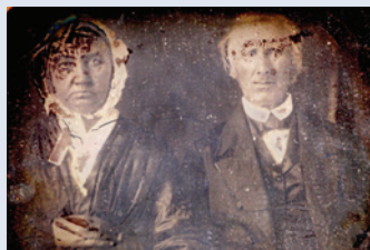
Portrait from the Osborn-Timpke Estate

Portraiture as an art form goes back as far as 5,000 years ago in ancient Egypt. Before the invention of photography, a portrait which was painted, sculpted, or drawn was the only way to record a person's appearance. Portraits depict the essence of a person or group. This exhibition features historic portraits from the Museum's collection exploring the different stages of human life.