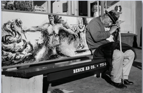
Sueño , Photo by Luis C. Garza

Images are paired to encourage the viewer to form a unique vision from the selected combination. The works in the exhibition were selected for their ability to evoke multivalent layers of memory.