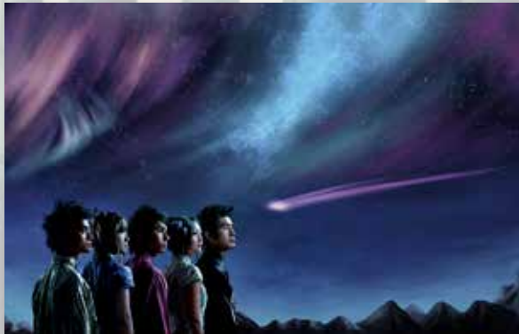
The Five Heroes, from the project Manga Dreams.

Originating in Japan, manga—meaning “cartoon”—bridges popular culture and contemporary art. The artists invited non-professional participants from the street, providing styling while encouraging them to invent unique backstories.