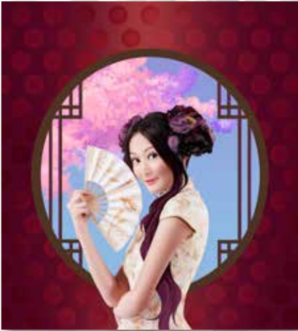
Cherry Blossom , from the project Manga Dreams.

Anime Film Festival at the Rialto Theater - all showings are $5 Spirited Away , Friday, July 10, 7 pm. Howl's Moving Castle , Saturday, July 11, 2 pm. Evangelion: 3.0+1.01 Thrice Upon A Time , Saturday, July 11, 7 pm. For $5 tickets visit RialtoTheaterCenter.org or 970-962-2120.