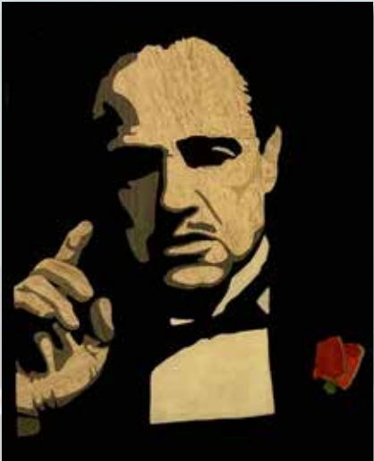
Fred 6, by Fred Schmidt

Demonstrations - July 10, August 14, Sept 11, 5:30 - 7:30 pm