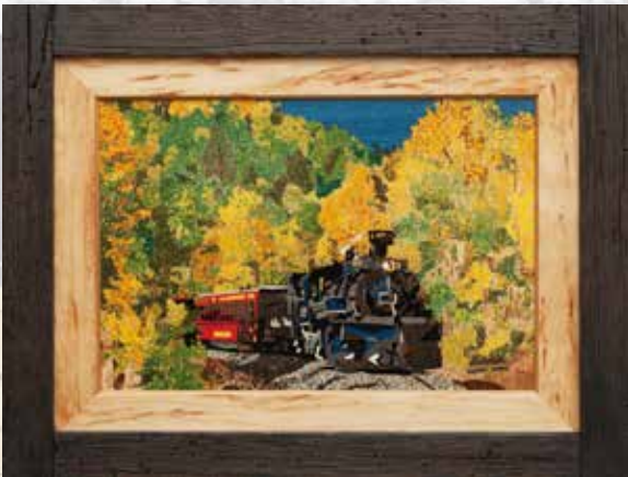
Mikel's Train, by Mikel Levine

Today, marquetry endures as both craft and fine art, blending material, technique, and imagination.